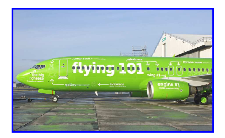
Airliner Parts Identification