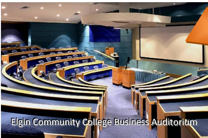
Elgin Community College Business Auditorium

http://chicagolandglidercouncil.com/seminar