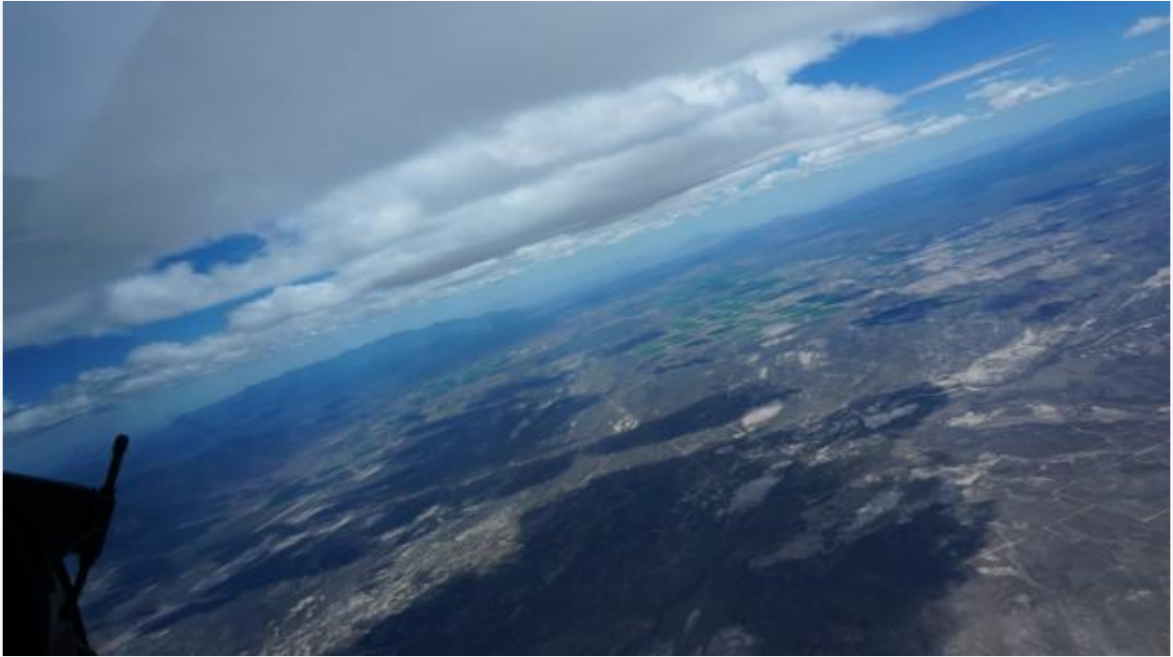
Streeting allows another fast flight

below that mark, the longest around 1,250 km. His turn points included Ely NV, Page AR and Heber City UT. Just like the rest of the group, Thorsten freely shared his substantial insights into the local flying conditions and routes, having attended the camp multiple times.