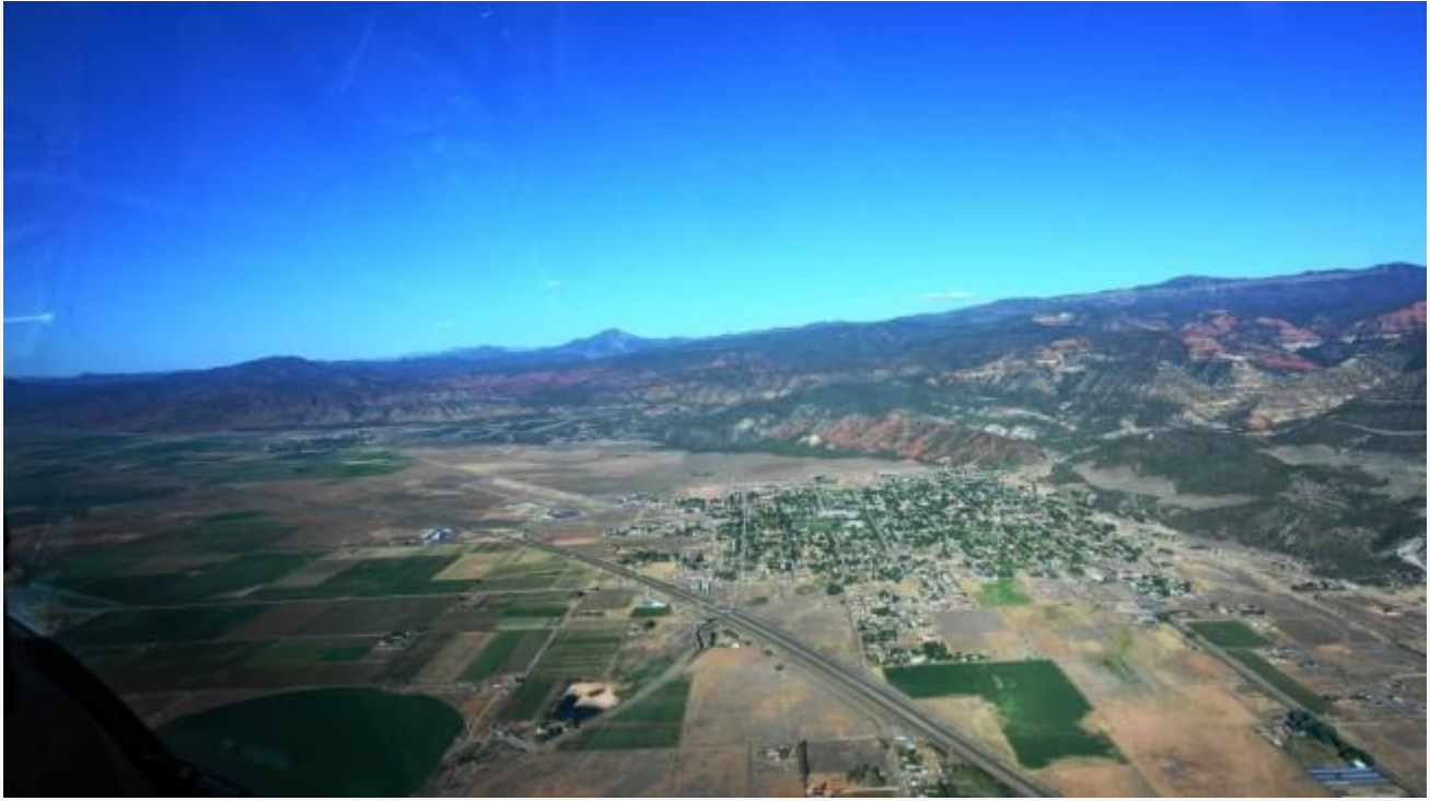
Return to Parowan from the South, seen from ca. 9,000'

Well, did I really deserve this absolutely perfect vacation experience? Of course not, there is nobody watching or doling out rewards and punishment. It all comes down to what few people know is actually Newton's Fourth Law: You Have To Show Up. If you're not taking your chances, if you don't take that tow or make that trip, you'll never know how good or bad it's going to be. So go and make that trip – to Parowan!