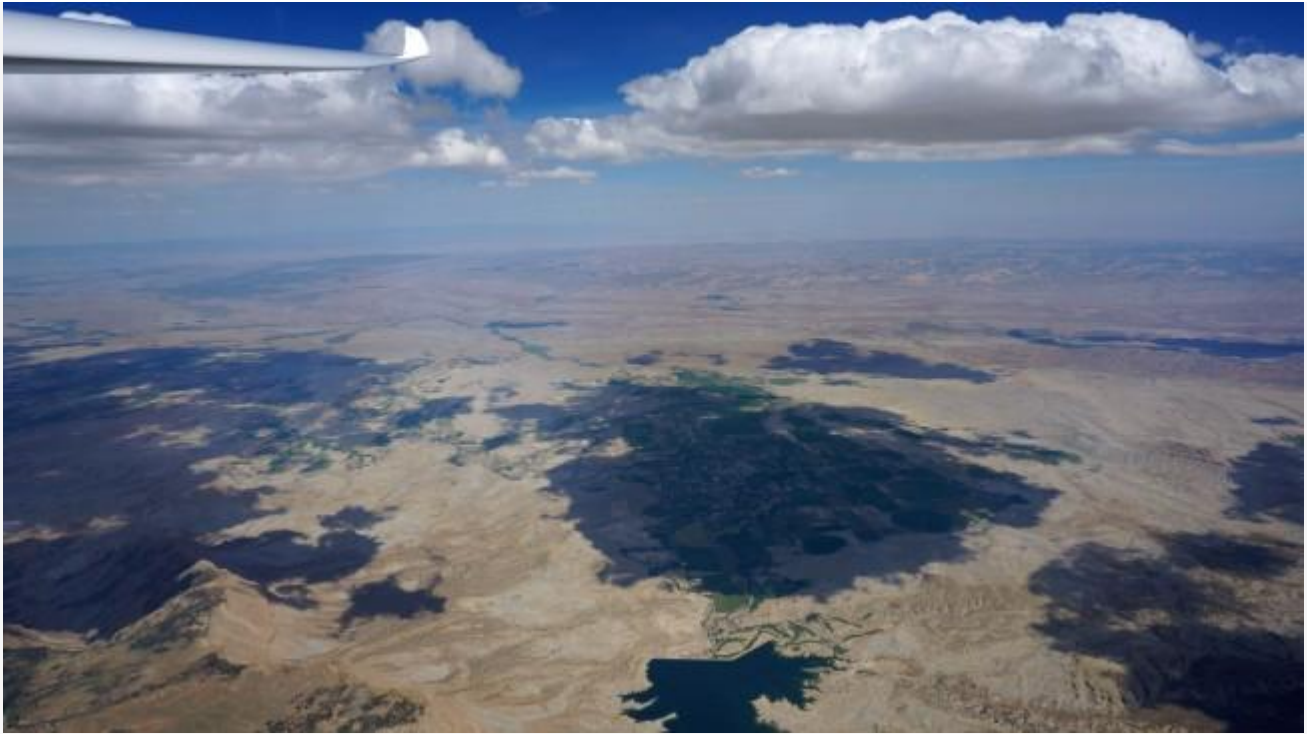
Over Castle Dale UT approaching the Huntington turnpoint, at 17k

Imagine landing after a full day of flying between 15 and 18 k altitude and coming down very pleased with yourself around 7 PM. You tie down the glider, stroll over to the bath house to clean up and walk into the ASA-rented hangar. There, a full catered meal cooked or barbequed by fine local chefs waits for you, complete with refreshments and desert – all for $10 to $15. That routine was kept up throughout the camp, every night! This was one well organized and fun event, my hat comes off to the Board of Directors and the many volunteers of the ASA for pulling this off.