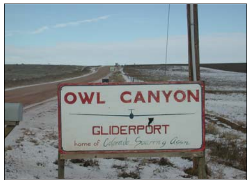
Photos taken last week in the sunny southwest—home of the Colorado Soaring Association. It's cold there too!