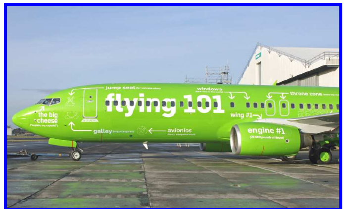
Airliner Parts Identification