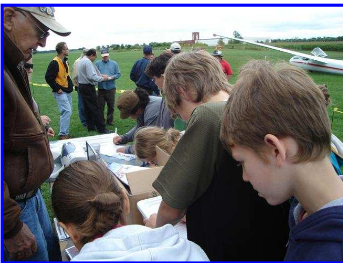
Signup Table at the EAA Young Eagles Event Sky Soaring ~ Aug 29, 2009