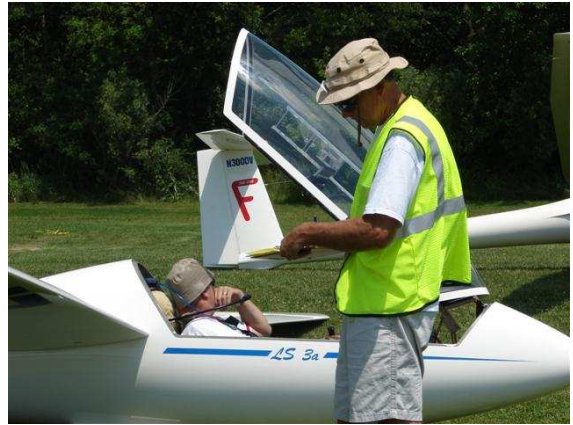
SSI Mini-Contest 2010