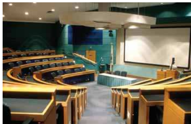
Elgin Community College - Seigle Auditorium

http://chicagolandglidercouncil.com/seminar