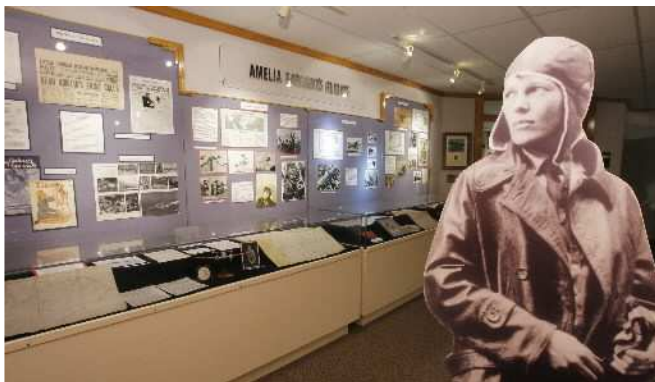
99s Museum of Women Pilots in Oklahoma City

The annual 99's Chicago Aviation Expo will be held at the Itasca Country Club located at 400 East Orchard Street, Itasca, IL 60143-1773. (630) 773-1800. That's just north of Irving Park road, in the center of Itasca. This is a great event with vendors and multiple speakers on various topics. The CLGC provides two tables for any glider club to provide information to the public and one table for the Civil Air Patrol.