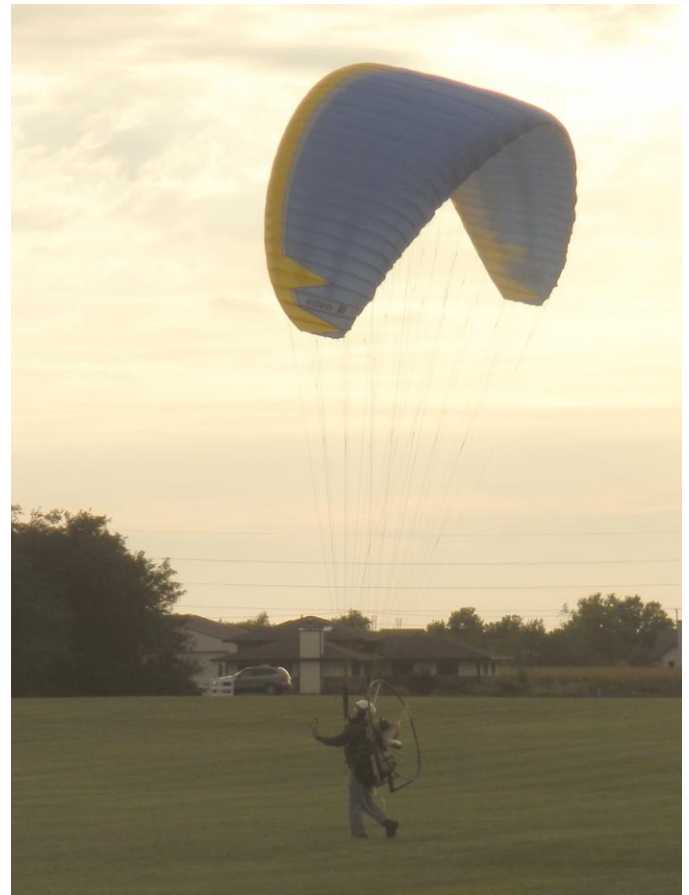
taken at Chicago Glider Club

It's the perfect time for a little powered paragliding to cap off the day!